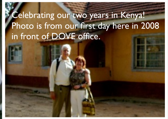
Celebrating our two years in Kenya! Photo is from our first day here in 2008 in front of DOVE office.

DONATE THRU PAYPAL ON WEBSITE ABOVE OR MAIL CHECK TO: SCMI 1200 TOWN CENTER DR. #424 JUPITER, FL 33458