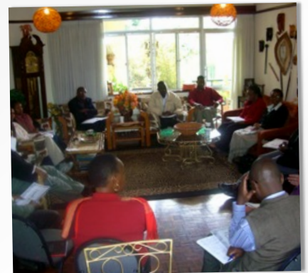
COACH WORKSHOP SEPT. 2