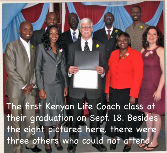
The first Kenyan Life Coach class at their graduation on Sept. 18. Besides the eight pictured here, there were three others who could not attend.

You may have noticed that we have stopped updating you monthly on our financial needs. We have chosen instead to once a year communicate our need for financial support. So, you'll be hearing from us in October about how you can partner with us in Kenya!