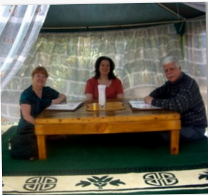
CELEBRATING AT KOREAN BBQ