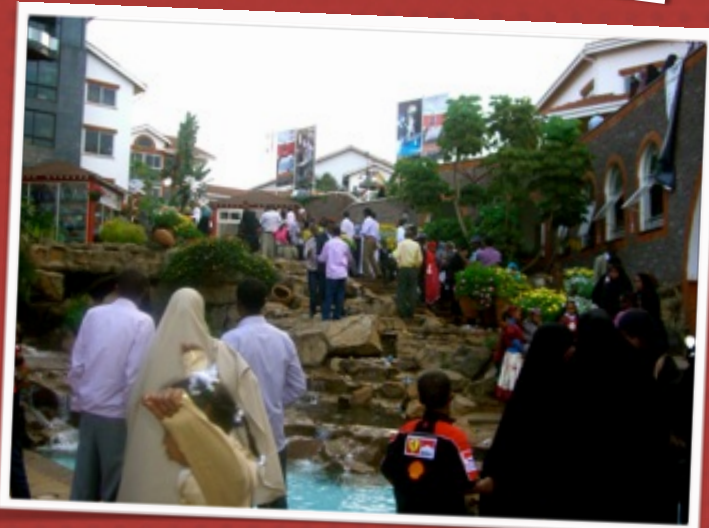
We visited Village Market on our way to Limuru where we saw more Moselms in one place than we ever have, even though we live near a Mosque. They were celebrating Eid.